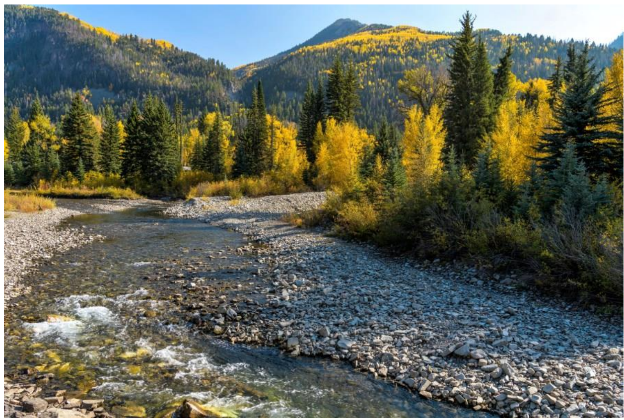
A sunny Autumn afternoon in Crystal River Valley. Marble, Colorado.